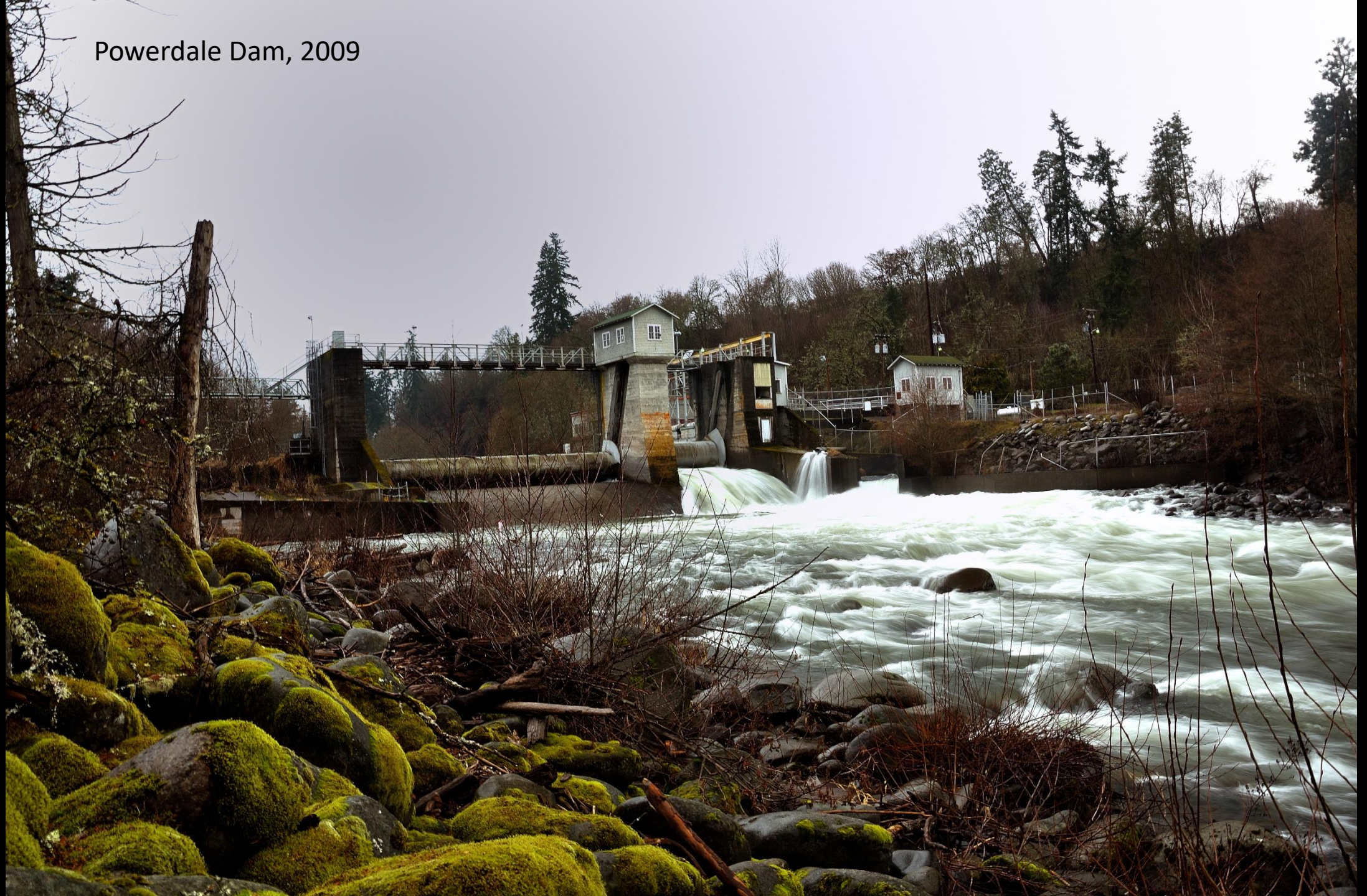
Powerdale Dam, 2009