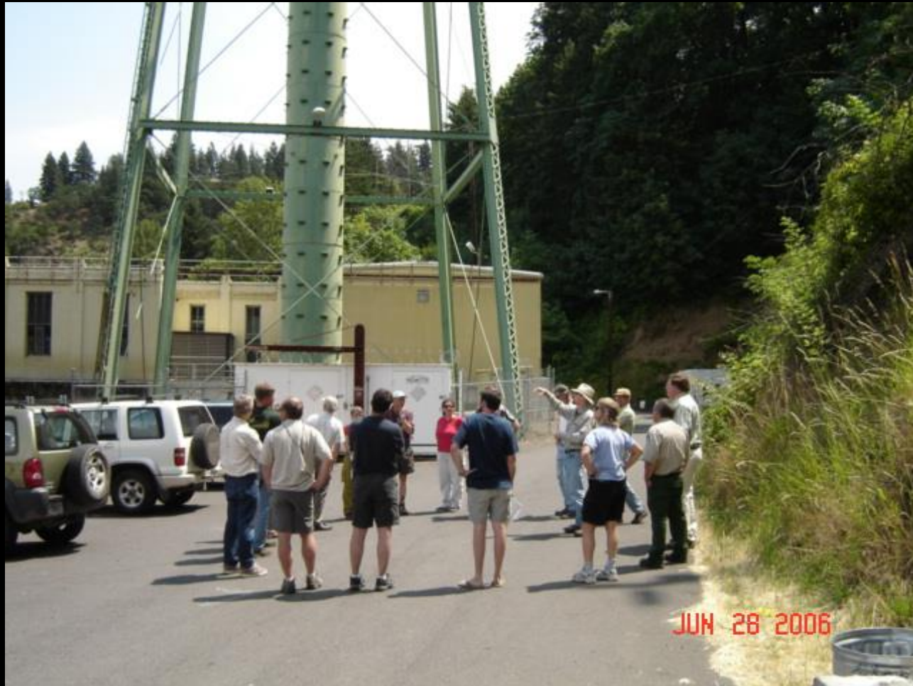
Community members discuss decommissioning plans with representatives from PacifiCorp