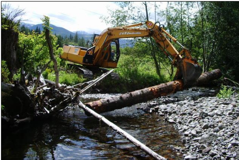
Figure 3. Installation of large wood structures on W. Fork Hood River in 2007.