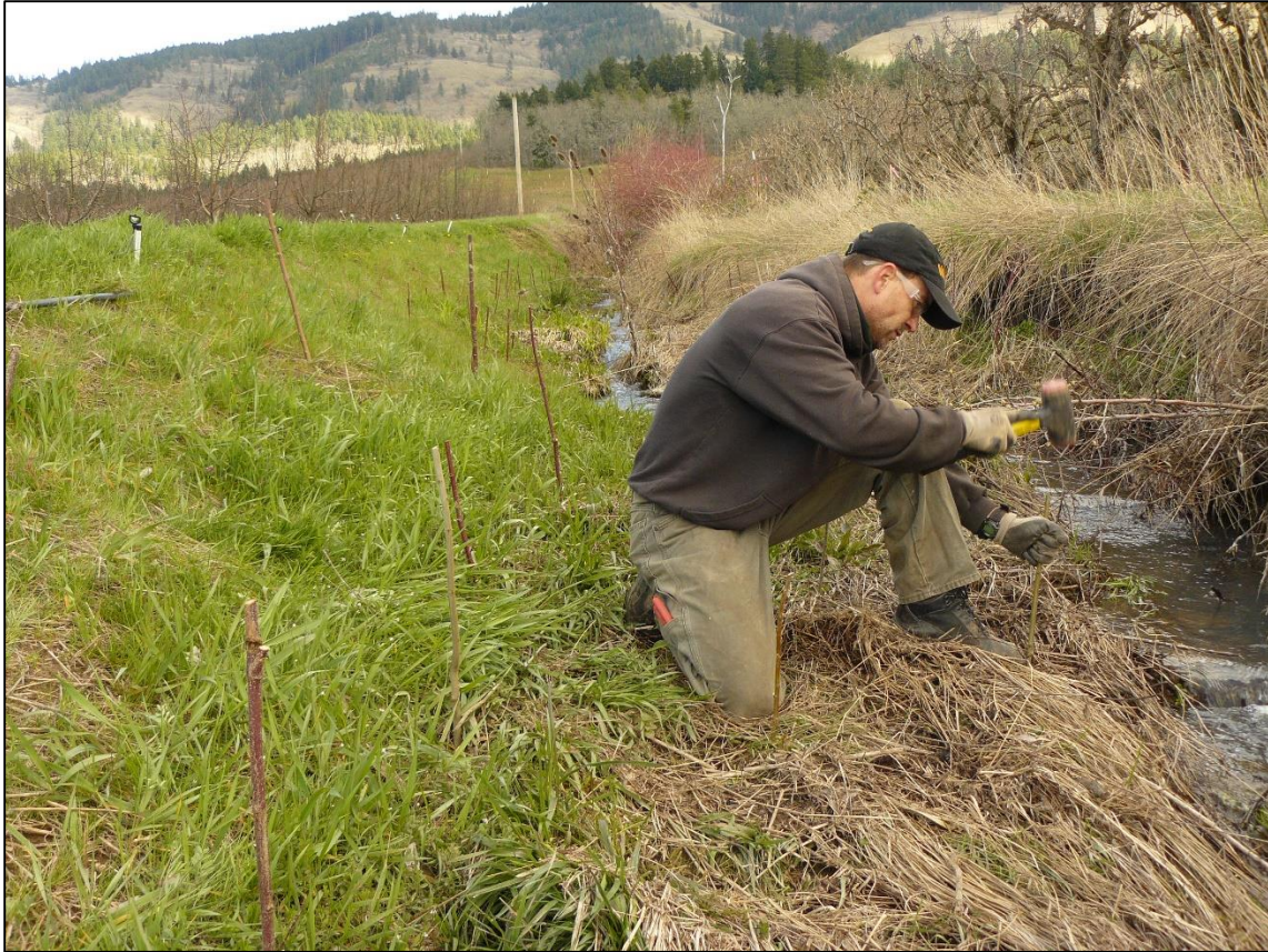
Figure 2. Installation of willow and dogwood cuttings along a waterway adjacent to orchard land.