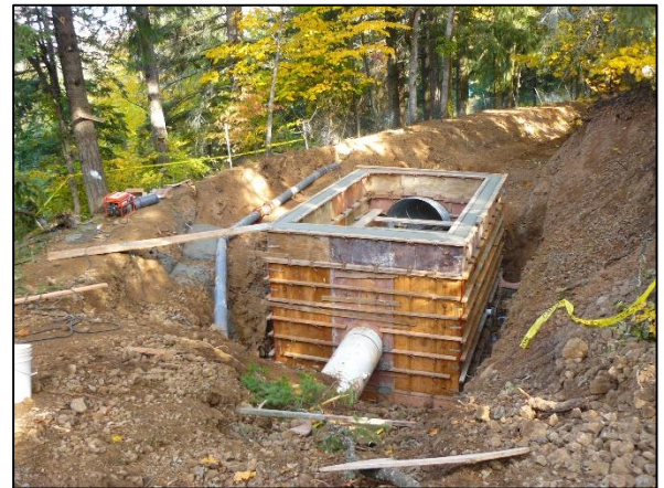
Figure 4. Central Canal Pipeline project under construction.

Description: EFID's Central Canal was replaced with 4.7 miles of pipeline. This linked the EFID Main Canal with the Lower Eastside Lateral and reduced the use of Neal Creek for irrigation water conveyance from 42 cfs to approximately 5 cfs. Consequently, average turbidity levels in West Fork Neal Creek went from 72 to 11 NTU downstream of EFID's inflow. A fish passage barrier and poorly functioning fish screen on Neal Creek were eliminated, which opened up 4.8 miles of spawning habitat for winter steelhead and eliminated the entrainment of fish in the Lower East Side Lateral Canal. 3.88 cfs of water was conserved resulting in a 1.88 cfs East Fork Hood River instream water right.