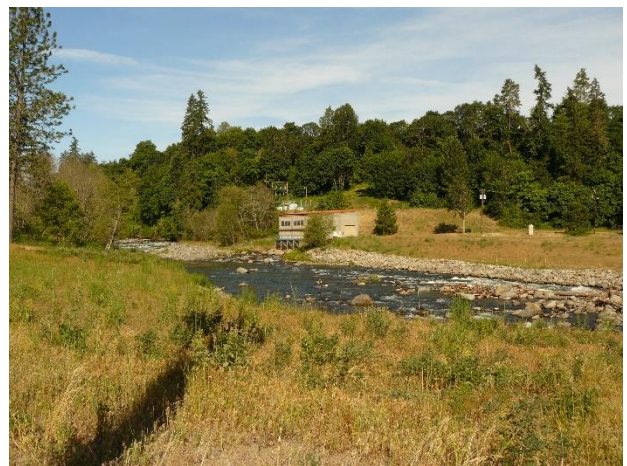
Figure 6. Powerdale Dam in 2009 (photo on left) and two years after dam removal (2012).