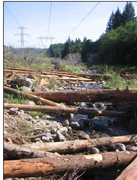
Figure 5. Elk Creek large wood project.

Description: CTWS and USFS installed 17 log jam structures with approximately 200 logs along the lower half-mile of Elk Creek. In addition, approximately 100 logs were installed along 2 acres of floodplain. About half of the project area was under the BPA powerlines. The project goal was to increase stream habitat quantity, complexity, and connectivity for summer steelhead and spring Chinook.